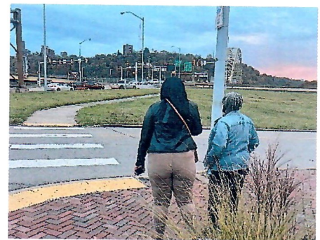
Manchester Residents Visiting And Claiming The Proposed Site For The African American Plaque